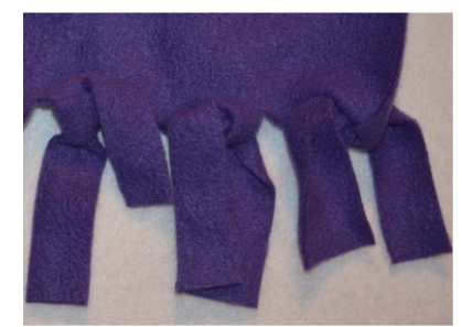
The blanket must lay flat when finished.