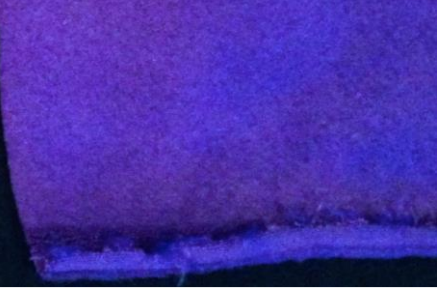
Example of un-even selvage that should be trimmed straight