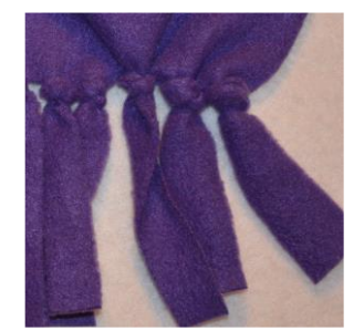
Do not tie the fringe too tightly or at the base of the fringe.