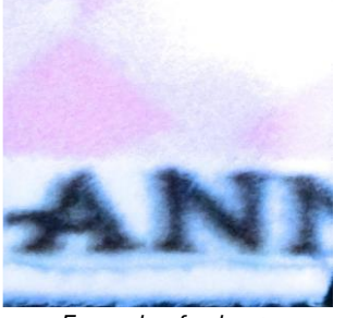
Example of selvage with words

Using sharp scissors and a long ruler, remove the selvage from each edge along the length of the fleece. The selvage sometimes has words printed on it or can be a different texture and/or color. The trimmed edge must be a straight, smooth line.